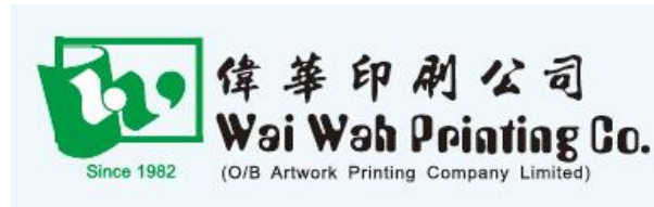
WAI WAH PRINTING COMPANY Booth: 5F - F33